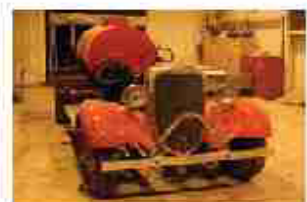
Renovation progress of Lizzie at Solano, 2006. Expected return date to WSHS January 2007. Lizzie will be the last Vocational Center project.