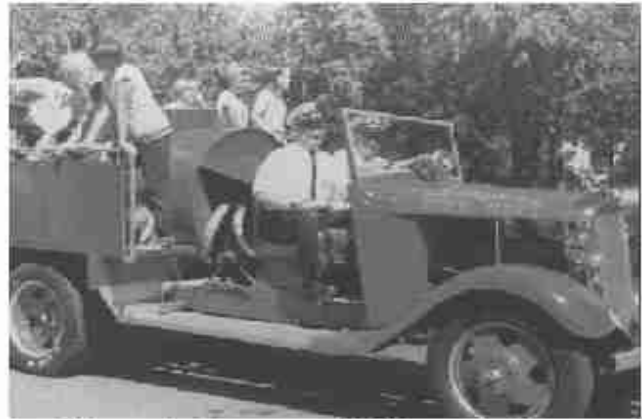
Bryte Volunteer Fire Department, 1935 Volunteer built Fire Apparatus known as Lizzie in the San Pedro Festival Parade, Ca 1960.