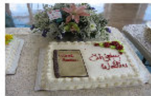
Cake honoring local author/historian!