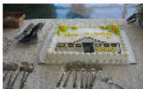
WSHS 17th Anniversary Cake!