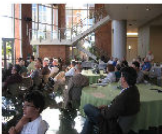
The audience of WSHS members and other interested community persons listening to presentation!